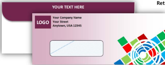
Custom Printed #9 or #10 Single Window