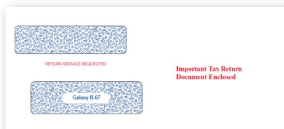
R-67 (FICS®) 500/box