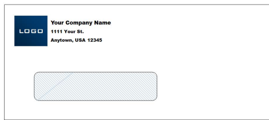
Custom Printed #10 Regular or Window Envelope (up to 4 color process)