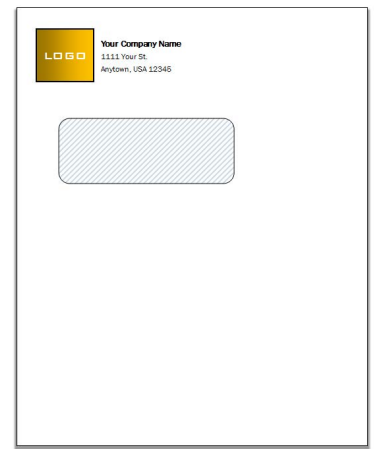
Custom Printed 9x12 Regular or Window Envelope (up to 4 color process)