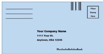
Return Envelopes (various colors and sizes available)